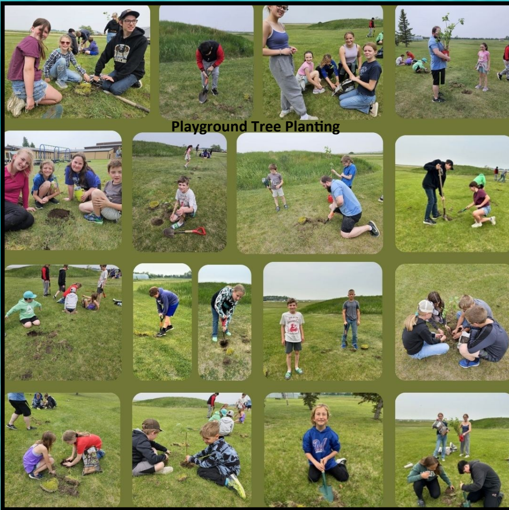
Playground Tree Planting