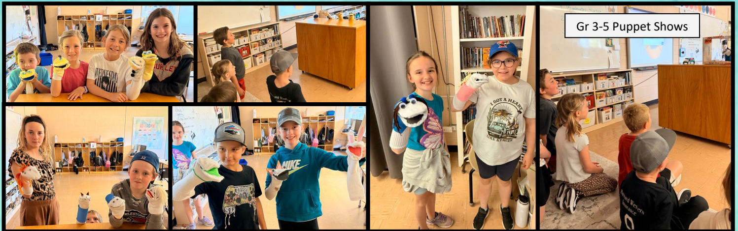
Gr 3-5 Puppet Shows