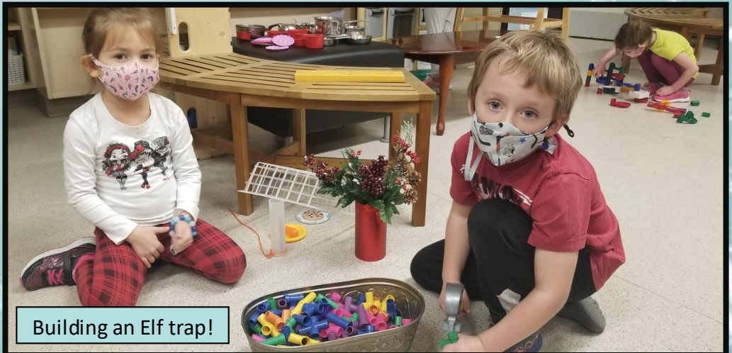
Building an Elf trap!

Decorate your window with a display of inspiring messages that brightens your community with positivity!