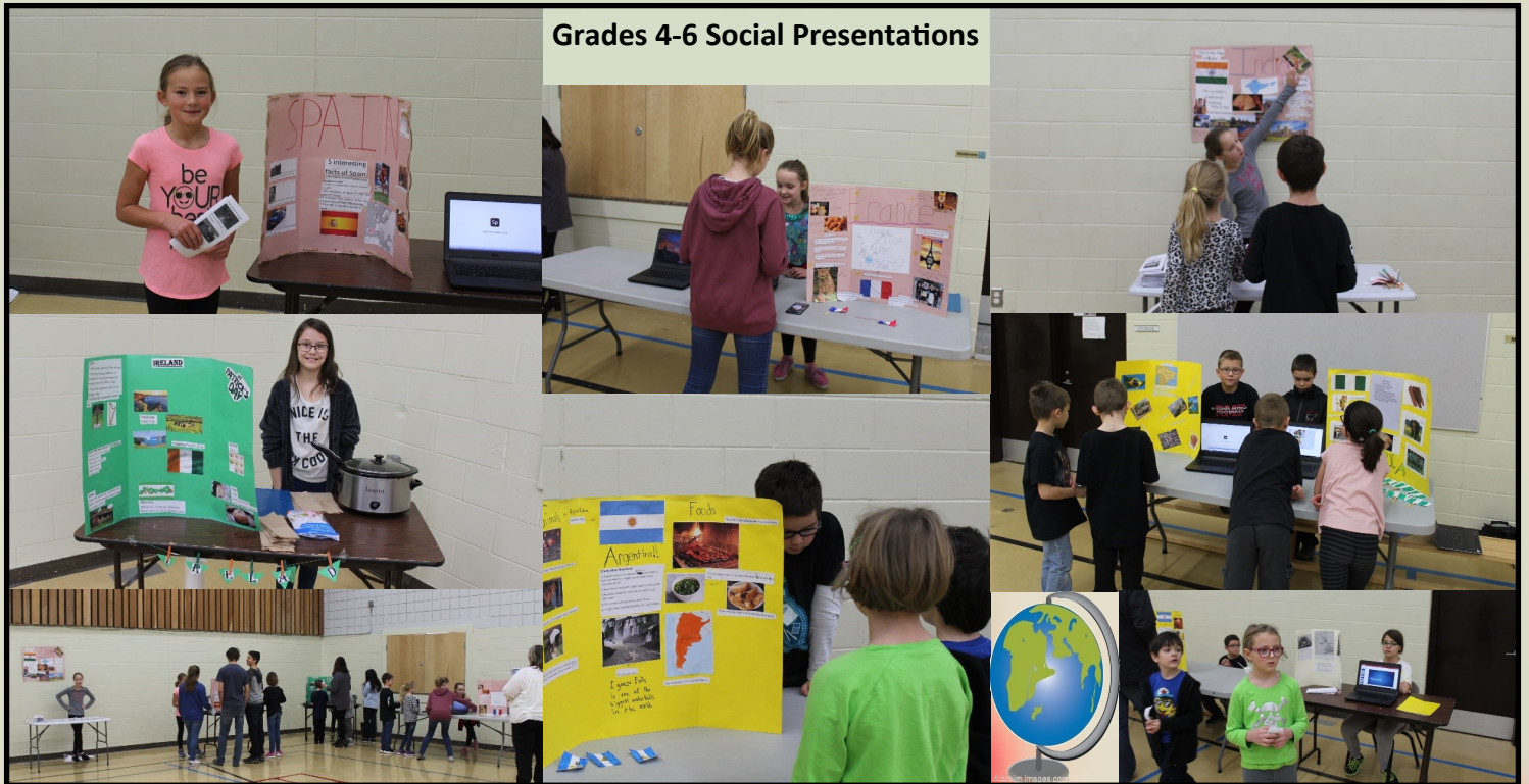
Grades 4-6 Social Presentations