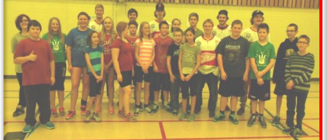
The Weyburn Red Wings visited our school on Dec. 3.