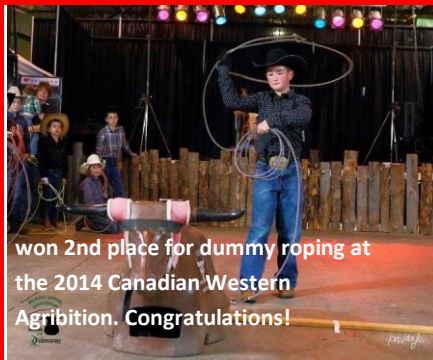
won 2nd place for dummy roping at the 2014 Canadian Western Agribition. Congratulations!