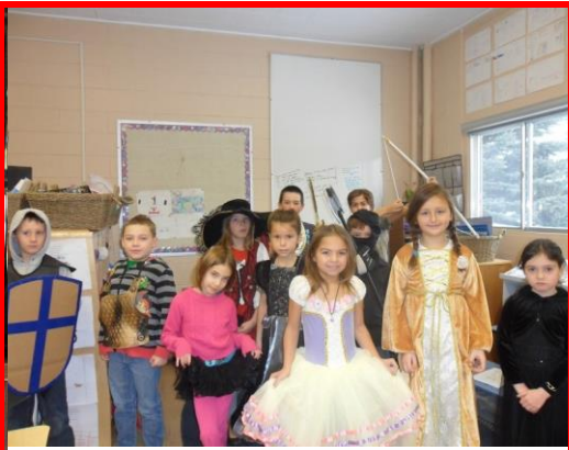
Top: Grades 3-5 get dressed up for Medieval Day Bottom: Christmas Character Dress Up Day