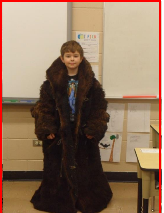
He models his Grandpa's buffalo coat that he wore when he was younger. He says it is soft and thick so it keeps the cold out.