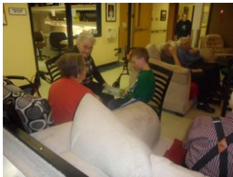
A student is reading to his great grandma and another care home resident during our Reading Visit.