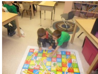
The students are engaged in practicing counting to 100 with a friendly game of Snakes and Ladders.