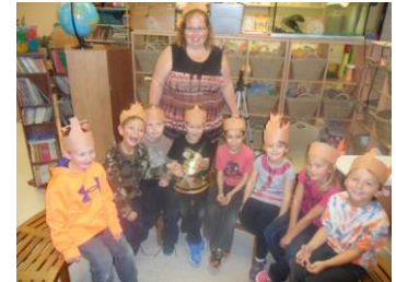
Turkey Day Spirit Award Winners