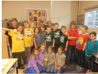
Twin Day Spirit Award Winners