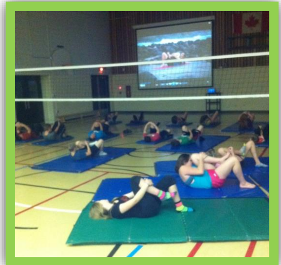
Grades 6-8 Staying Healthy