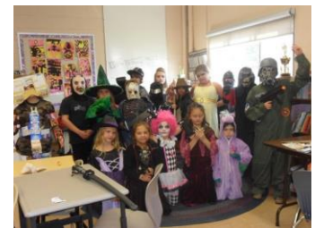
Grades 3-5 Halloween Costumes