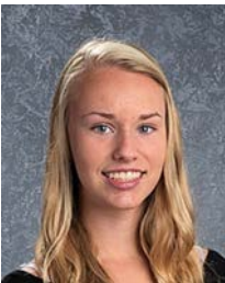
for her commitment in a leading role in the Alice in Wonderland production