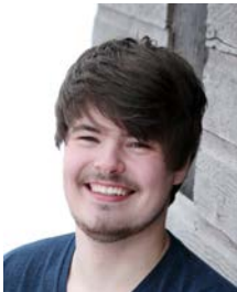
for his leadership role & dedication in the Alice in Wonderland production