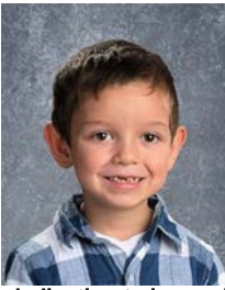
for his dedication to improving his reading and math skills