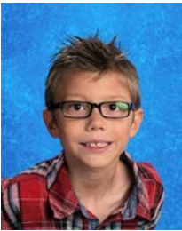
for excellence in understanding his math and science