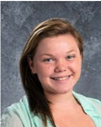
for her motivation to do her best, caring about peers and showing gratitude