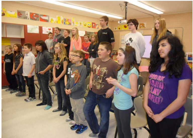
The junior high school students are rehearsing in preparation for the music festival.