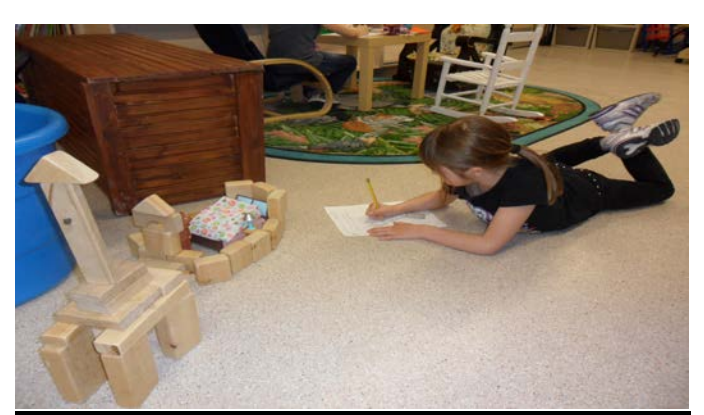
In their study of structures, Miss Quigley's students were to write a description of the shapes and dimensions of what they had built.