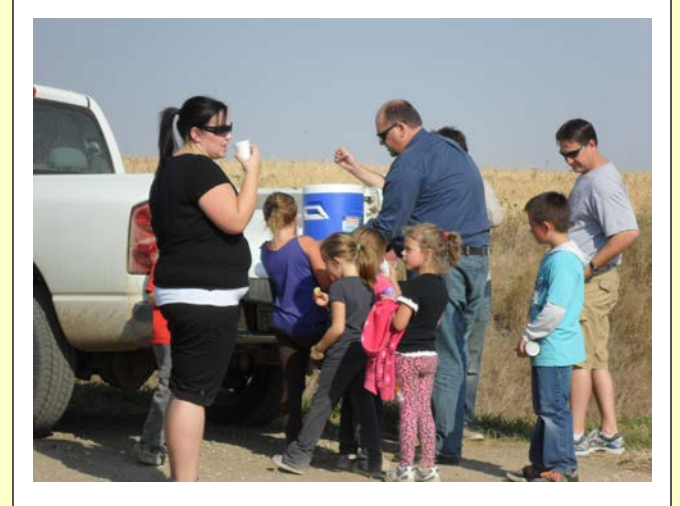
Stopping for refreshments during Terry Fox run