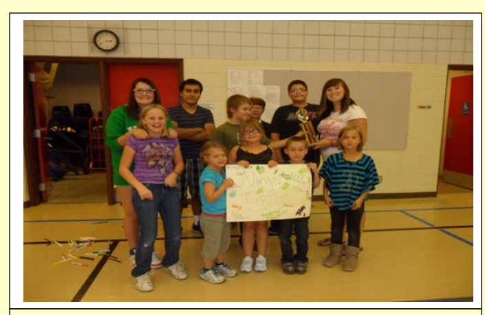
Winning team in SRC Welcome Back activities