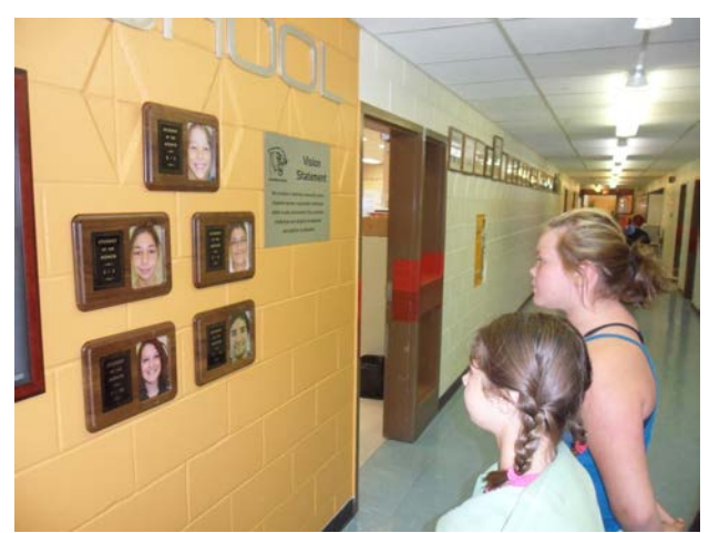
Students looking at new feature wall