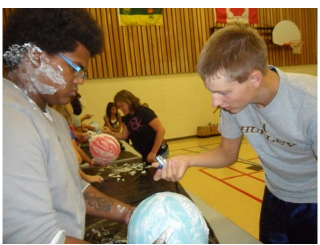
Senior students shaving in SRC activities

Pangman School Mission Statement To foster a collaborative environment in which individuals are challenged to achieve success. We value academic, physical, social and emotional development through independent thought and responsible action.