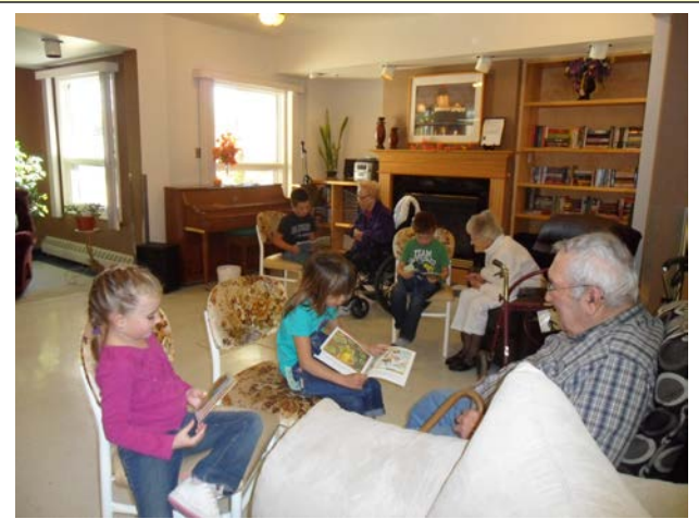
K-2 room visiting Care Home

Pangman School Mission Statement To foster a collaborative environment in which individuals are challenged to achieve success. We value academic, physical, social and emotional development through independent thought and responsible action.