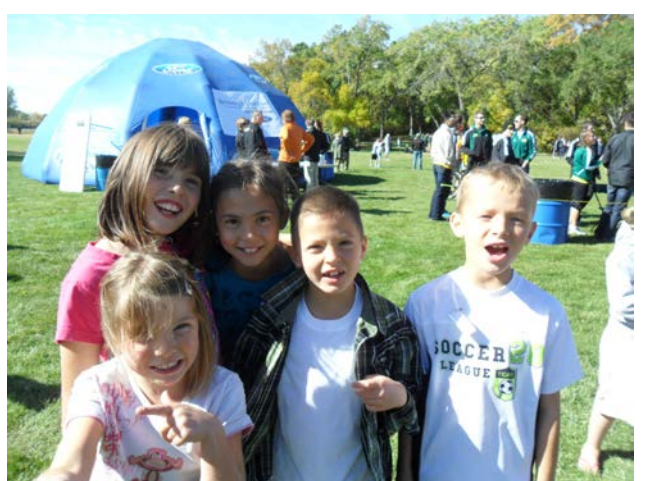
Pangman Students participating in Cougar Trot run