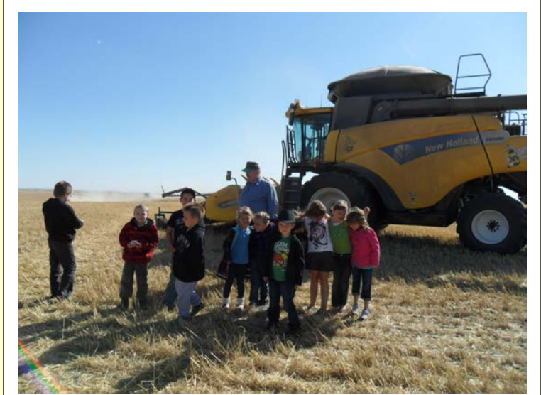
K-12 given the opportunity to see Charity Farms in action