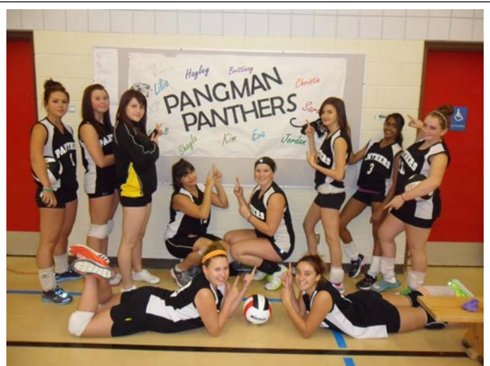
Sr. Girls won Gladmar Volleyball tournament Oct. 27

The SRC hosted Halloween activities in the gym on Oct. 31. The Spirit Teams played Halloween themed Pictionary & Charades. Costumes were varied and creative.