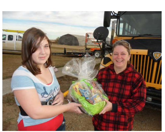
Bus Driver Appreciation Day Oct. 15