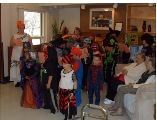
K-2's sang Halloween songs at Care Home

The SRC hosted Halloween activities in the gym on Oct. 31. The Spirit Teams played Halloween themed Pictionary & Charades. Costumes were varied and creative.