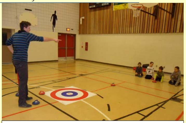
Learning to Curl

Pangman Student Ski Trip Saturday, March 3 Bus Departs School 7:15 AM -Return 7:00 PM