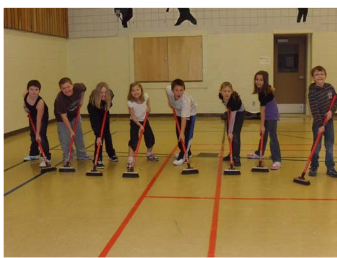
Grade 3-5 learning to "hurry hard"

The Ogema Curling Club had made arrangements to sponsor the "Rocks and Rings" curling program for our students. The instructors came to our school and used the gym to introduce the sport of curling to our students through many different fun physical activities. This was a great opportunity to learn about the game and maybe become involved in this sport.